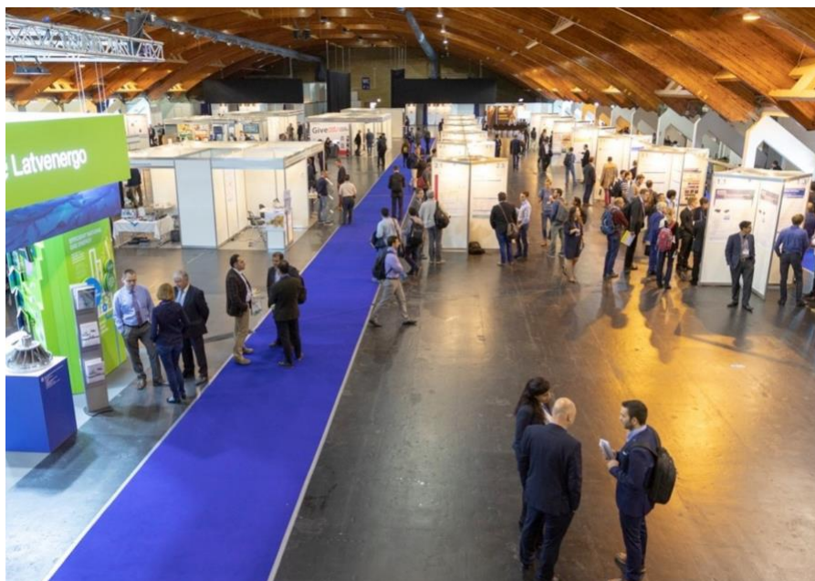
EPE'18 ECCE Europe, Riga – Exhibition and dialogue sessions

The 24 th Conference on Power Electronics and Applications (and Exhibition), EPE'22 ECCE (Energy Conversion Congress and Expo) Europe is co-sponsored by the EPE Association and IEEE PELS. It will take place at the Hannover Congress Centrum (HCC).